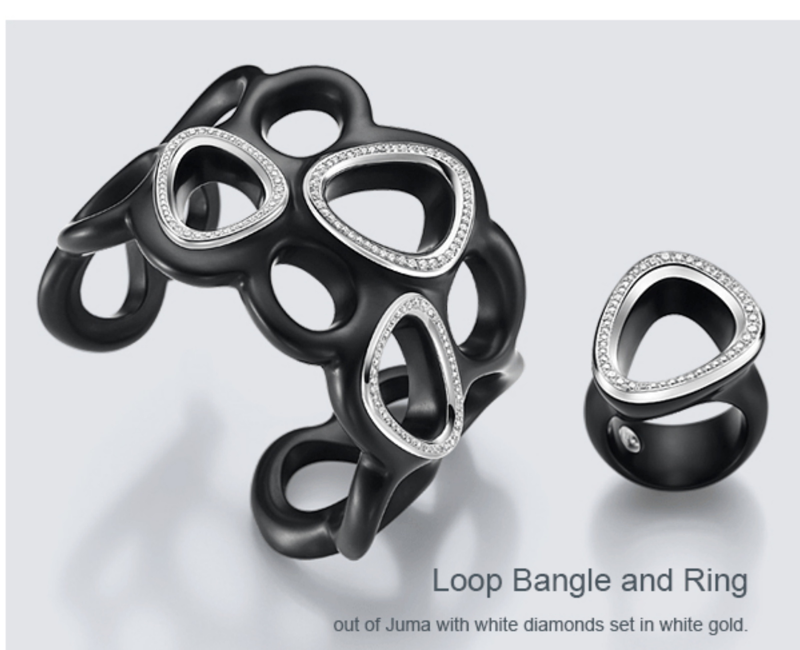
Loop Bangle and Ring

Not just the form but everything about this piece of jewellery is unique. Experience and skill in handling wood and mineral materials are what make this complex design possible. Development and production are also extremely sophisticated processes.