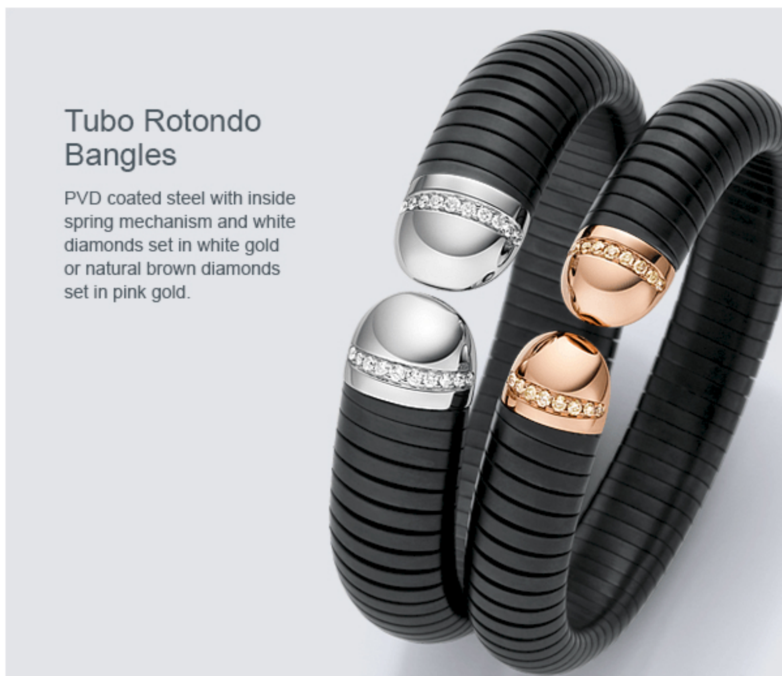
Tubo Rotondo Bangles

Right on trend: a really dark and deep anthracite grey. The latest PVD coating is called gun metal .