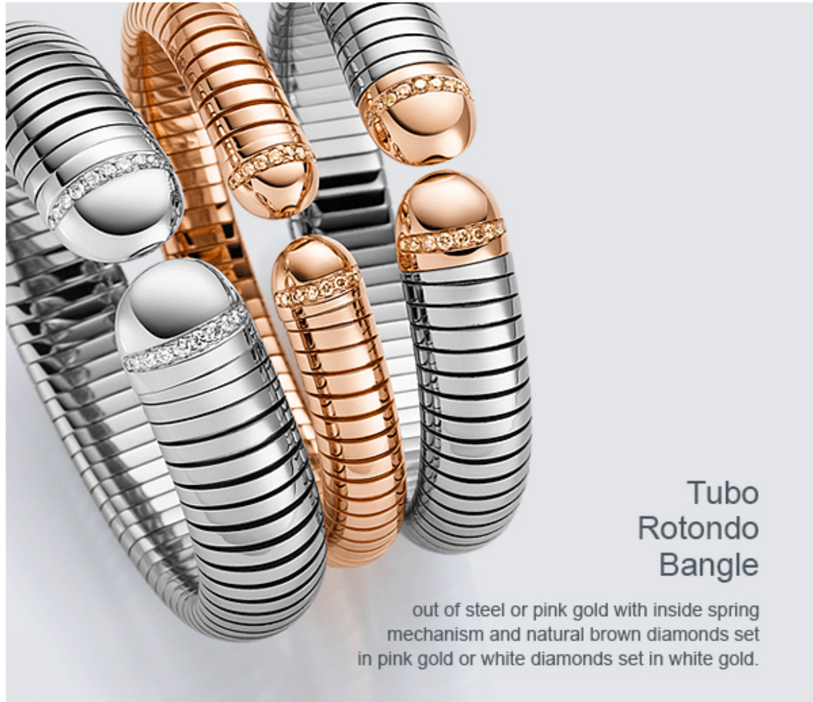
Tubo Rotondo Bangle

Curves and soft shapes are characteristics of Tubo Rotondo . The semi-circular profile underscores the new look and, worn together with other bangles in the Tubo collection, creates variety and interest.